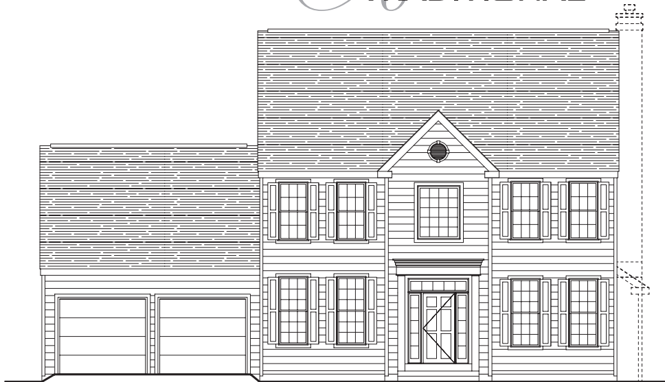
Standard All Siding Facade Shown with Optional Chimney