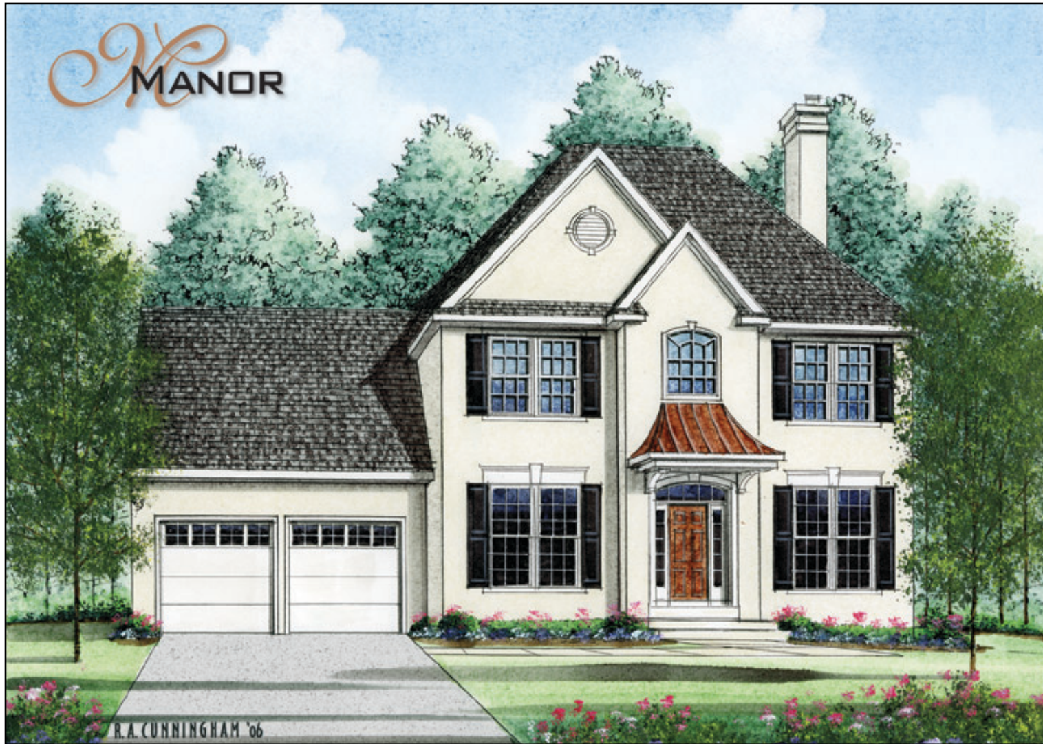
Rendering shown with multiple options. See sales manager for details