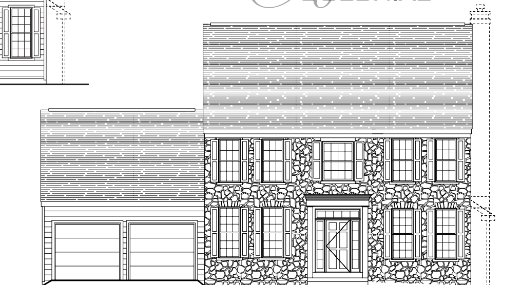
Stone & Vinyl Siding Facade Shown with Optional Chimney